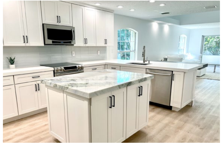
There's a stark difference between what the kitchen of the Schwartzes' Melbourne townhome looked like before the renovation began and now that it's completed, with new floors, countertops, cabinetry and hardware.